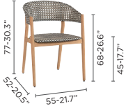
dining armchair rope